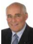
Chairperson Ulrich Schmitz, ThyssenKrupp AG

The Transatlantic Business Committee pursues the overall Chamber goal of achieving unrestricted trade and investment between the United States and Germany. In particular, the reduction of remaining non-tariff barriers is promoted. The committee brings leading figures in American and German politics together with representatives from prominent American and German firms to discuss current transatlantic business issues. The committee plays a leading role in the Chamber's efforts to support and lead to success of the Transatlantic Economic Initiative.