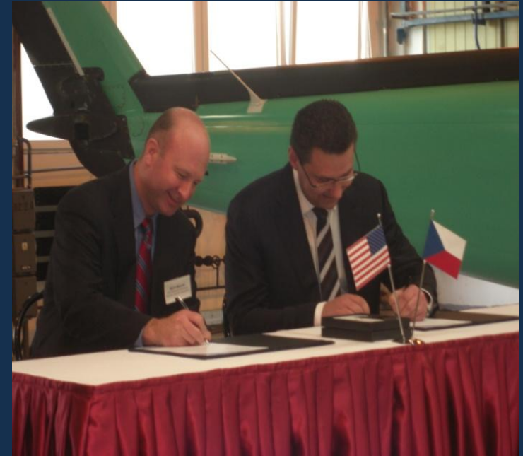
MOU signing at 250 th cabin delivery ceremony (2009)